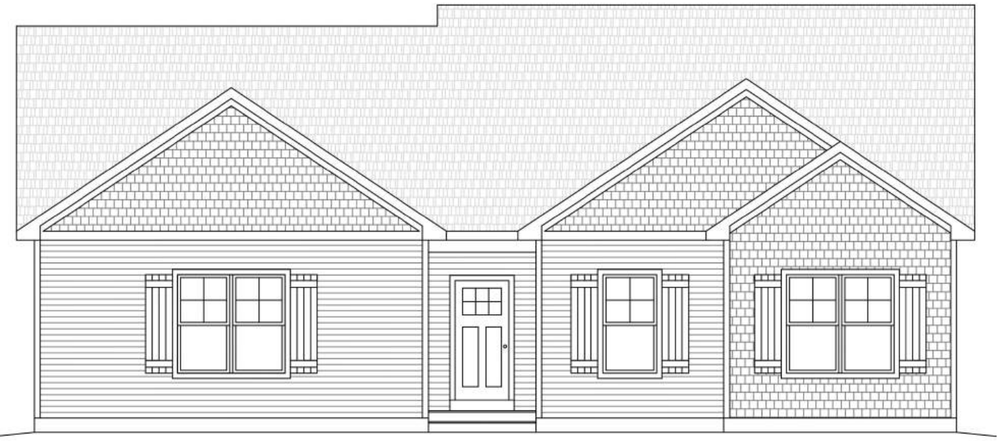
Optional Features Shown