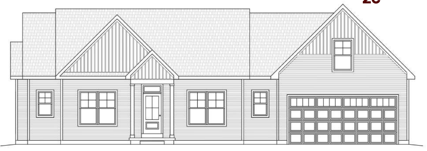
Optional Features Shown